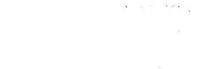
Figure 2. Relationship between the number of visits and the number of birds per visit.