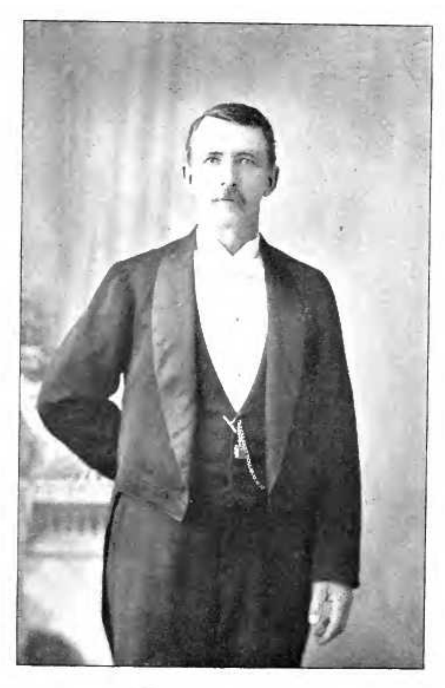
Very truly yours Chainley & reck