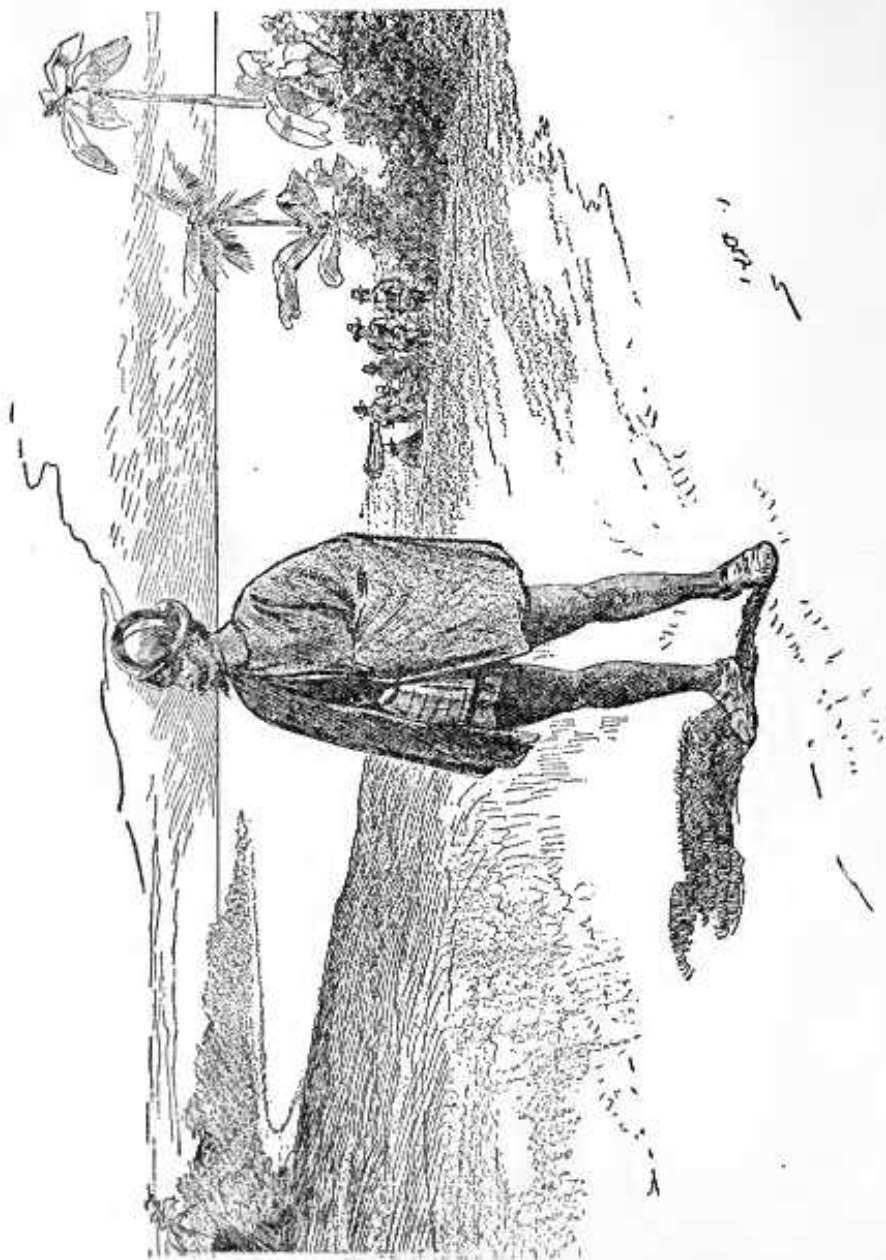
A MESSENGER ARMED ONLY WITH A KNIFE CONCEALED UNDER HIS CLOAK.