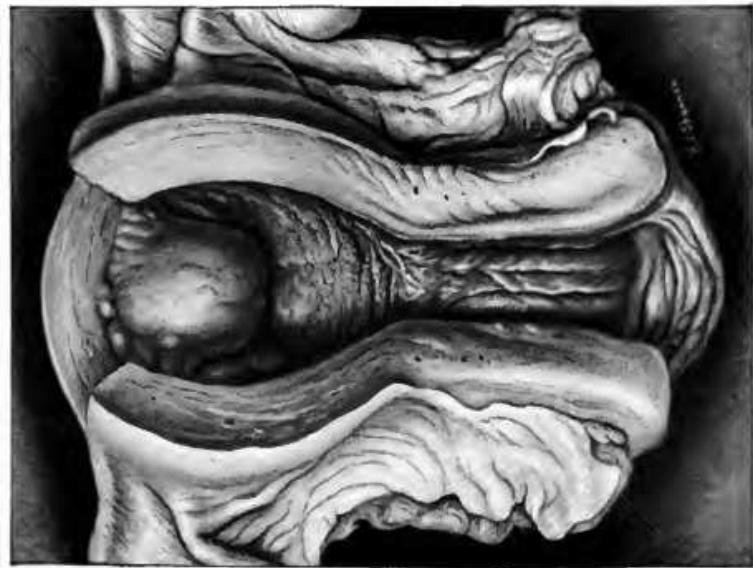
UTERUS REMOVED FROM PATIENT DYING OF STREPTOCOCCIC ENDO- METRITIS.—POSTABORTAL TYPE, PLACENTA IN SITU.