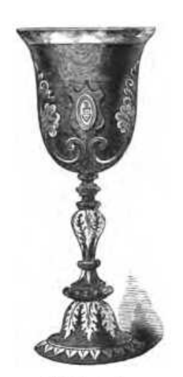
The Loving Cup.