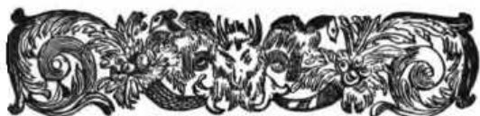
ILLUSTRATION TO VOL. XXXVII