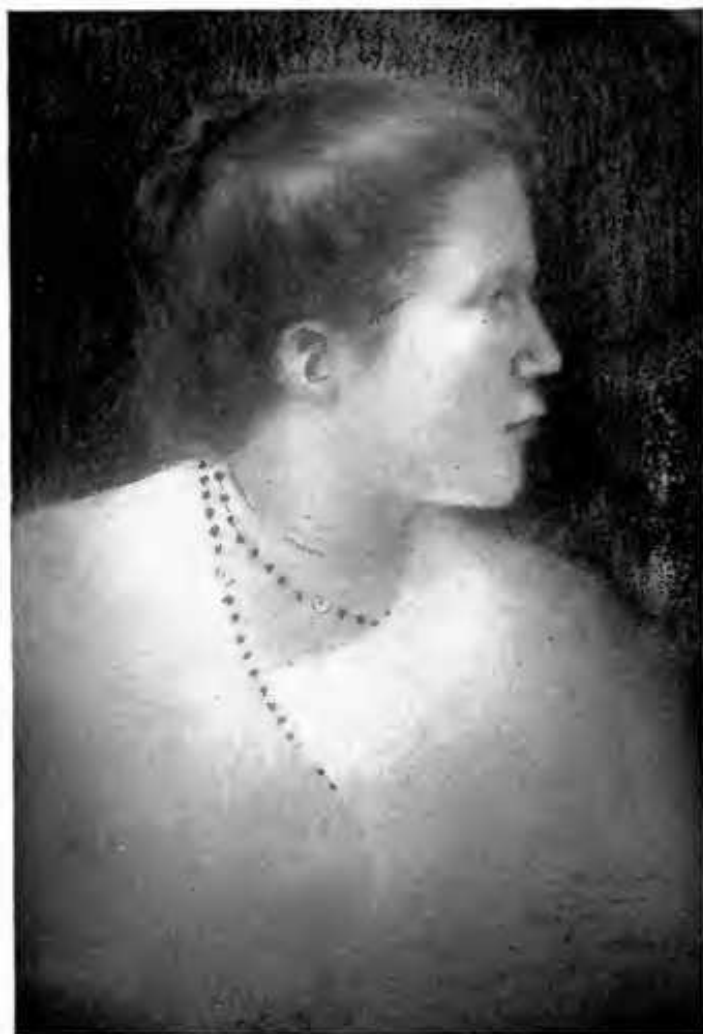
SISTER NIVEDITA (MARGARET E. NOBLE)