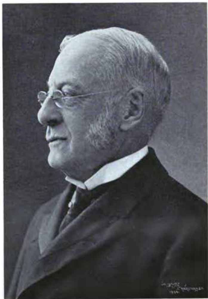
Charles W. Eliot