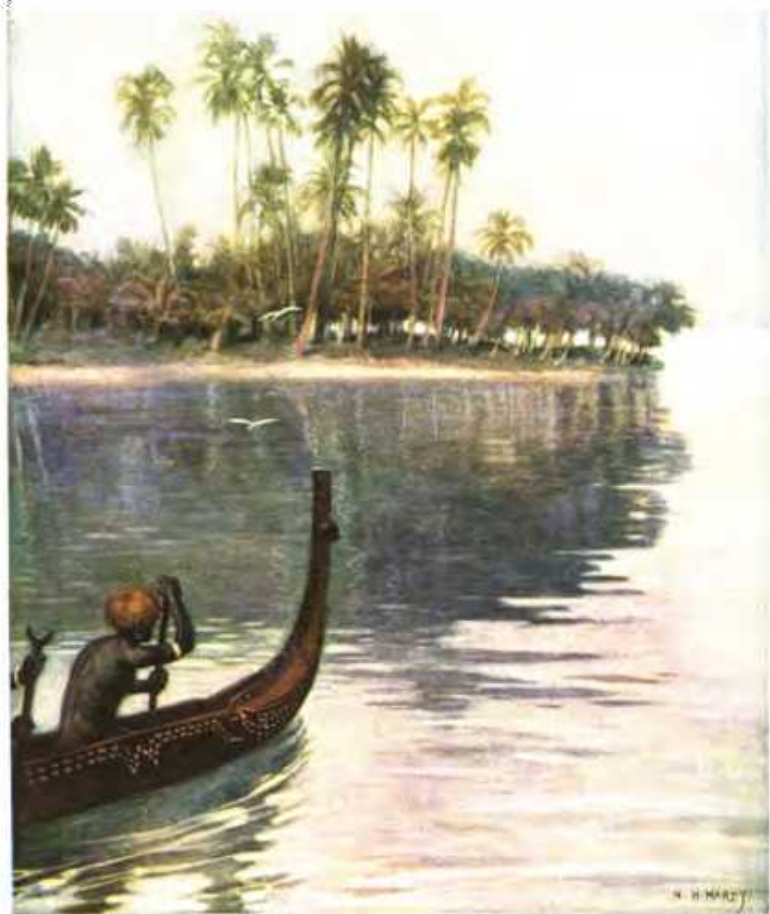
"PADDLING GENTLY OVER THE STILL WATERS" Page 23.