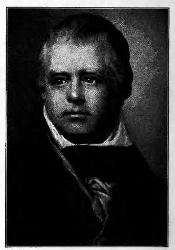
SIR WALTER SCOTT