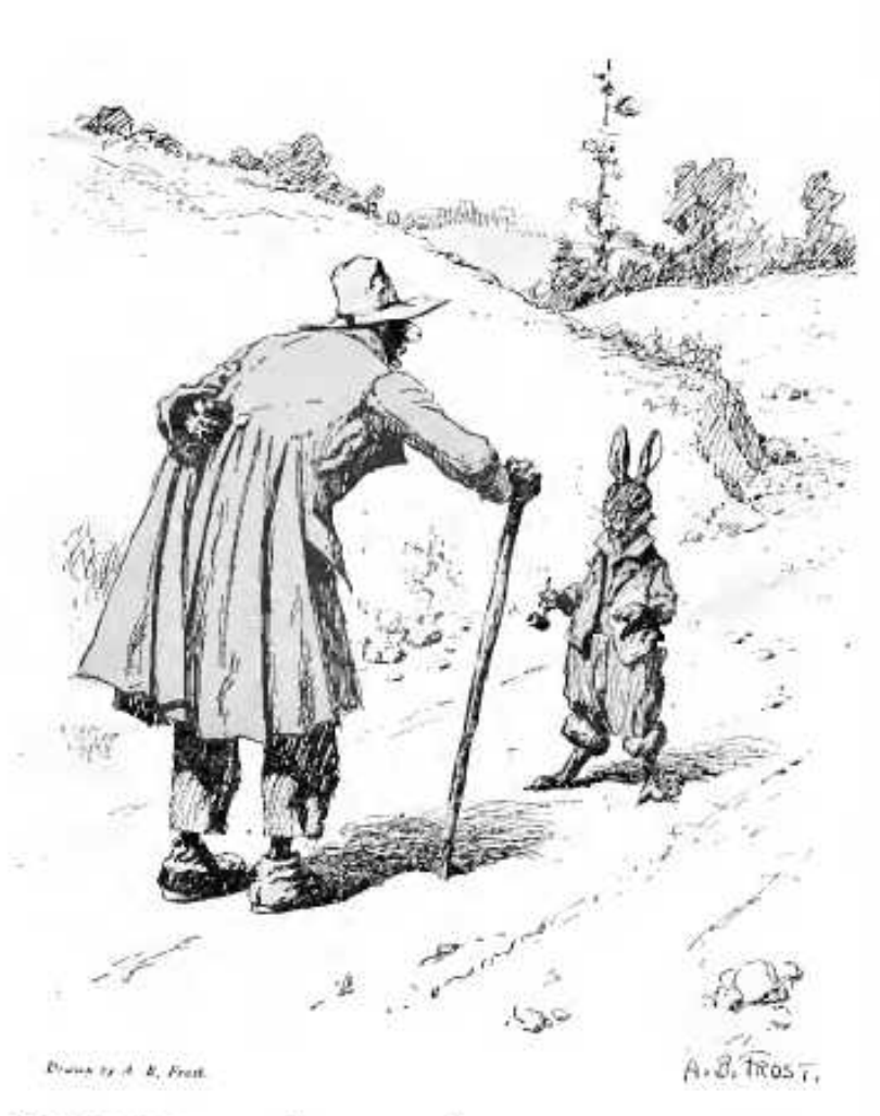
"BRER RABBIT AX 'IM EF HE'LL DO ER FAVOR FER ONE FR HIS OL' TIME FRIEN'S" (page 37)