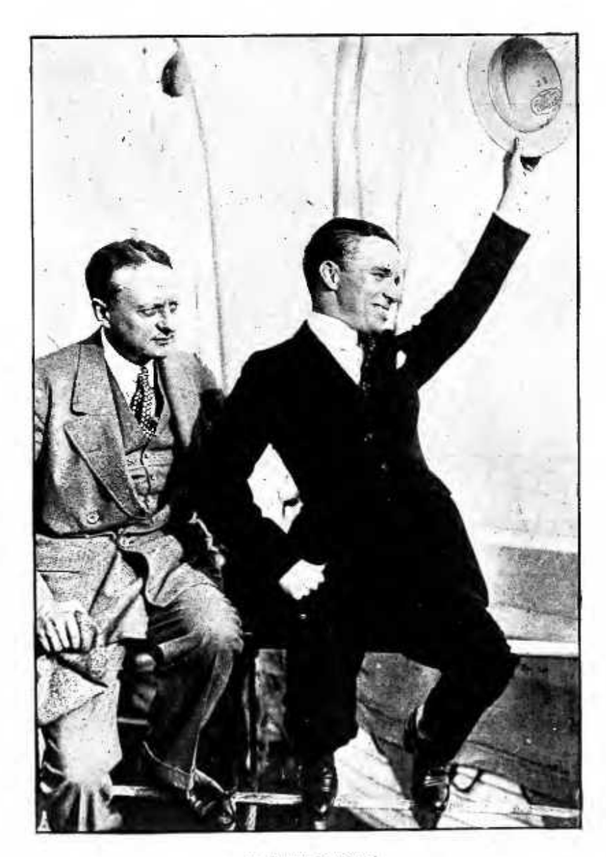
I SALUTE EUROPE!