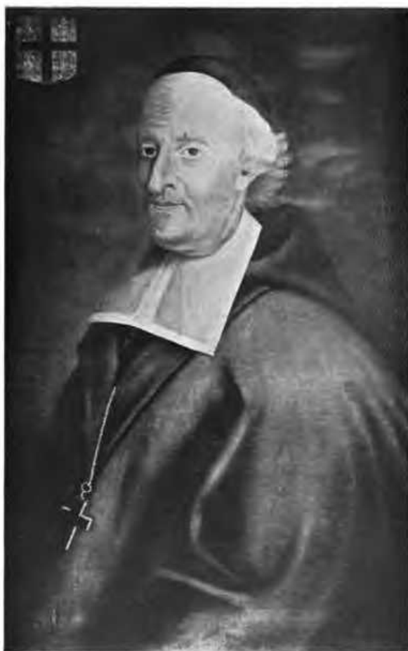
FRANÇOIS XAVIER DE LAVAL-MONTMORENCY.