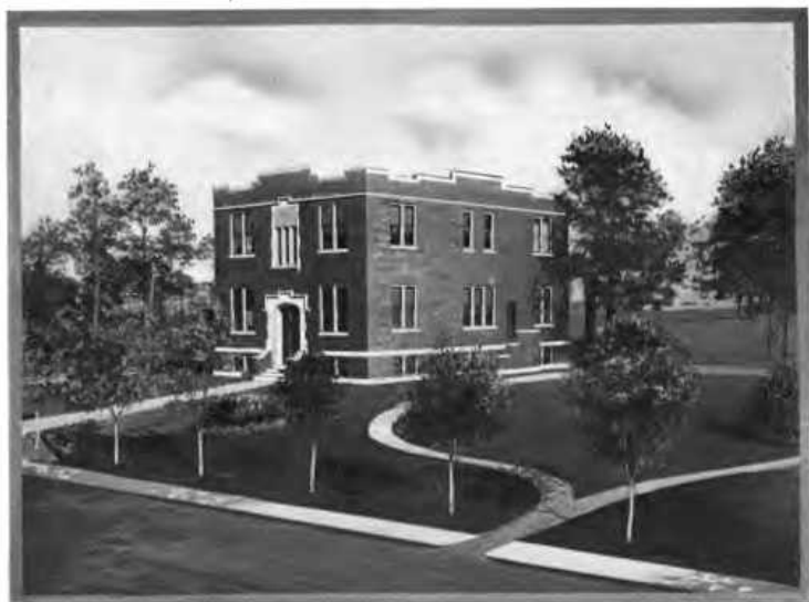
RESEARCH LABORATORY THE AMERICAN ROLLING MILL COMPANY MIDDLETOWN, OHIO