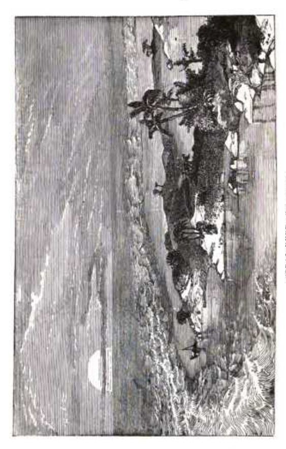
CORAL REEF. See pg. 163.