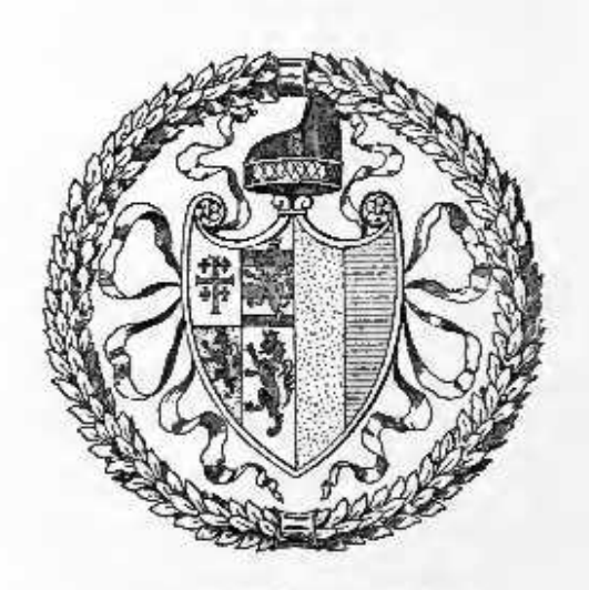
THE CORNARO COAT OF ARMS