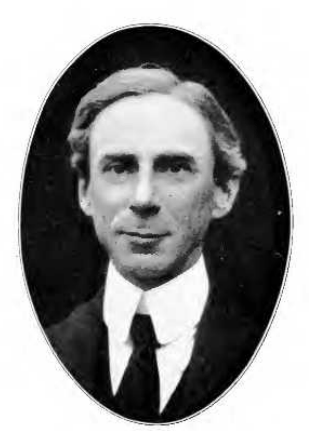
HONORABLE BERTHAND RUSSELL AUTHOR OF JUSTICE IN WAR TIME