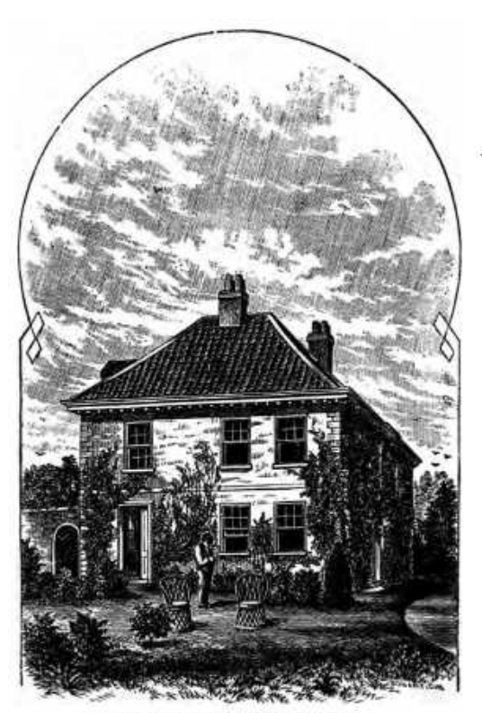
THE RECTORY AT EPWORTH, ENGLAND.