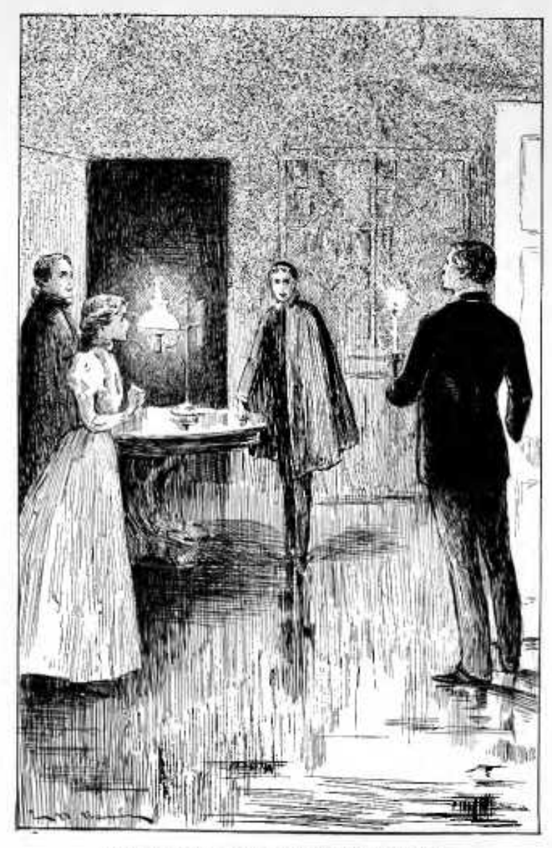
UNCLE JOHN AND THE YOUNG CUBANS.