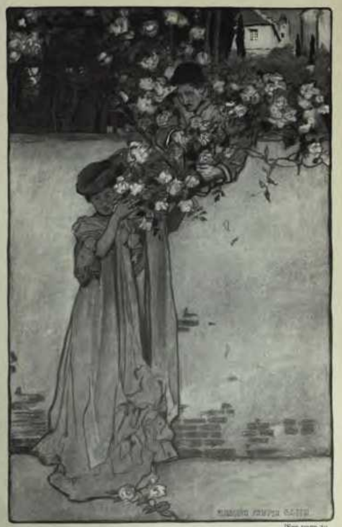
[See page 30