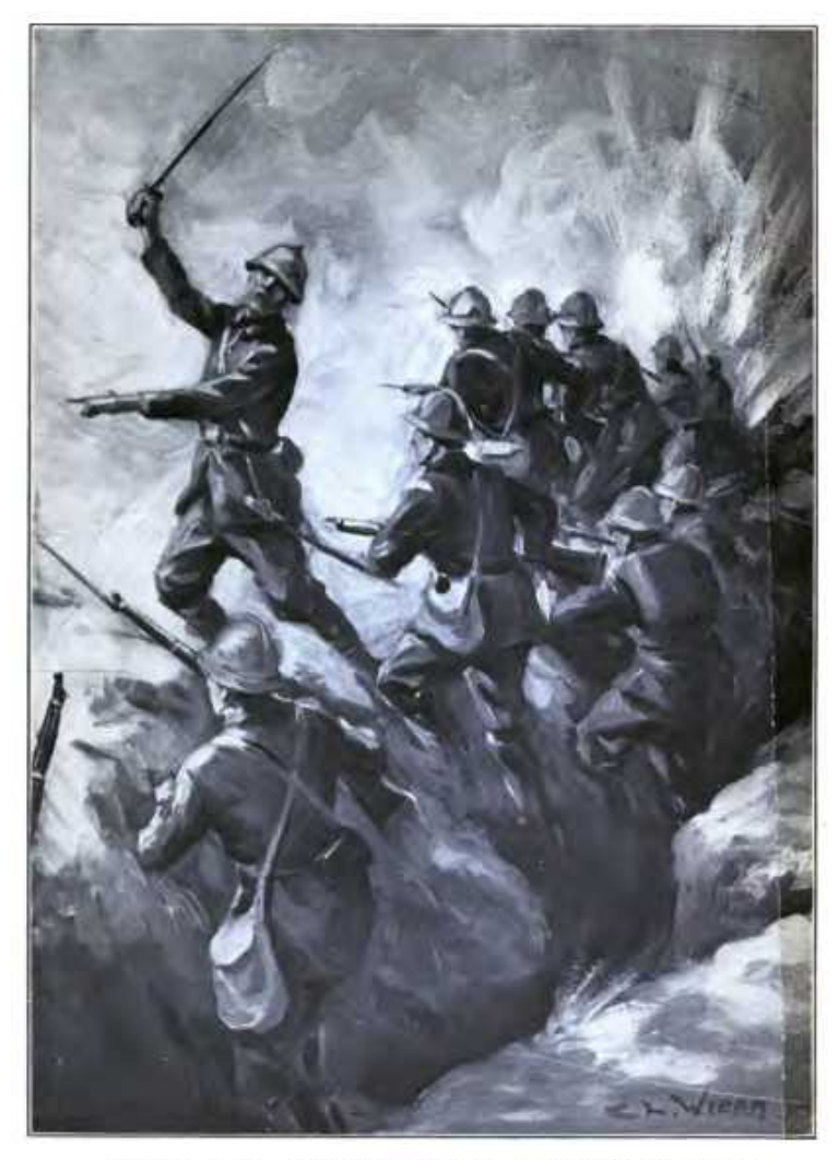
"Forward!" shouted the captain in a loud, clear voice. (Page 33.) Frontispiece.