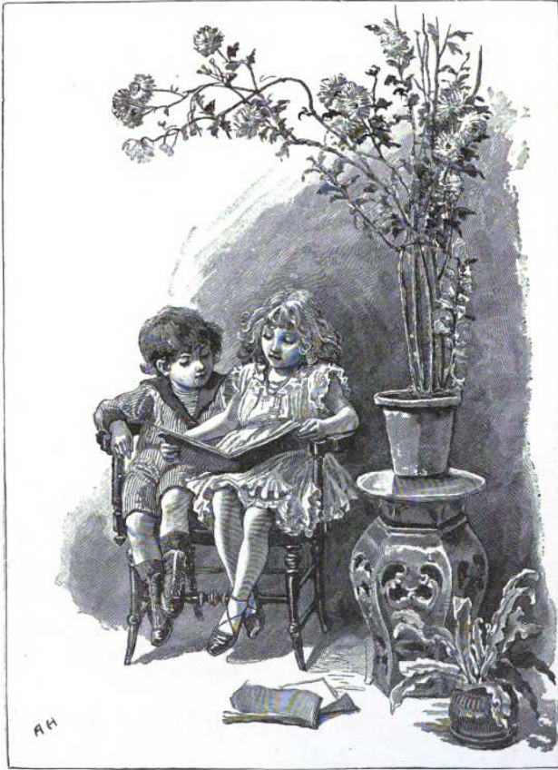
OUR NEW BOOK.