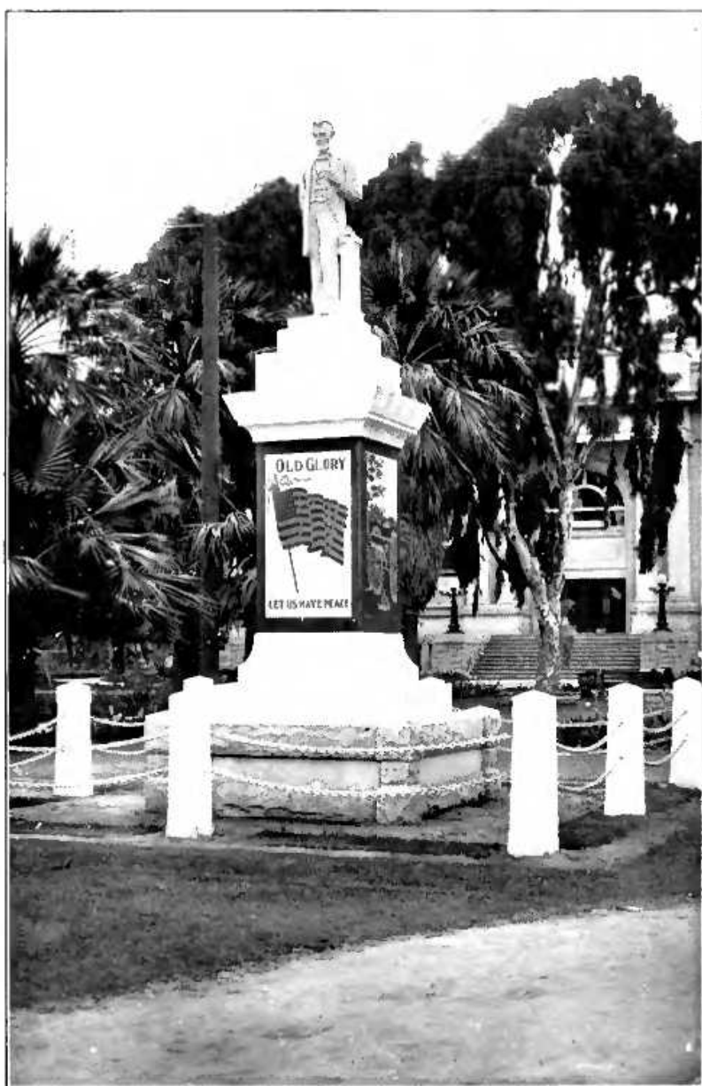
ABRAHAM LINCOLN, G. A. R. MONUMENT