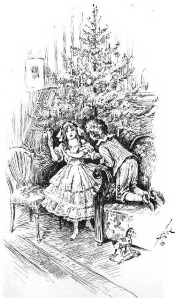
YOU HANG IT ON THE TREE, ANGELINA (page 86)