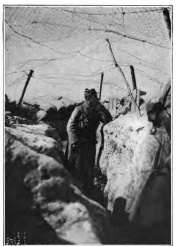
Underwood and Underwood.