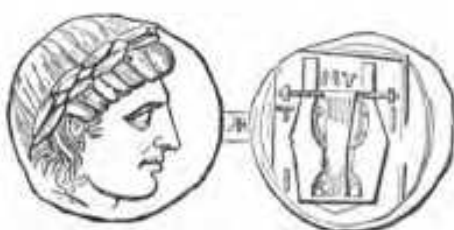
Coin of Mytilene.