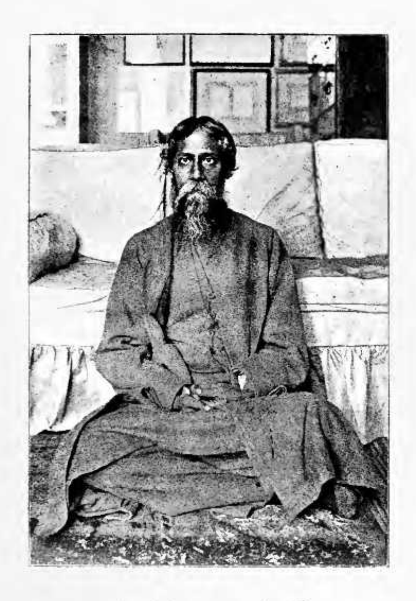
tive First instrumenth Tragere Town Thotographly plin Trems