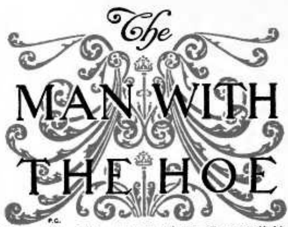
Gon made Man in His own Image . in the Image of Gon made He bim.