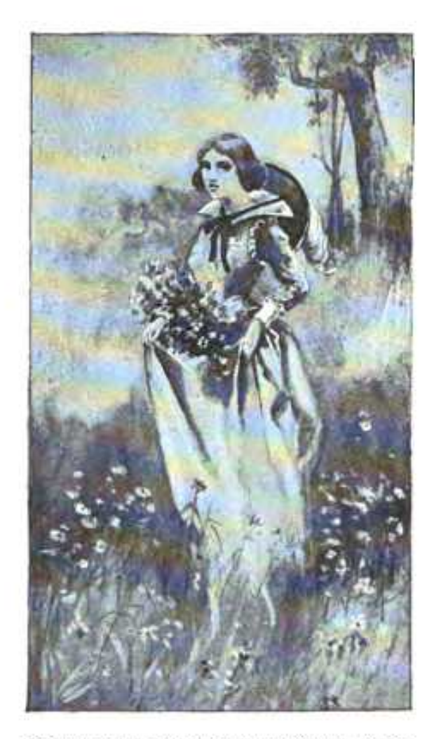
"TWAS IN THE GLORIOUS MONTH OF MAY."-Page 82.