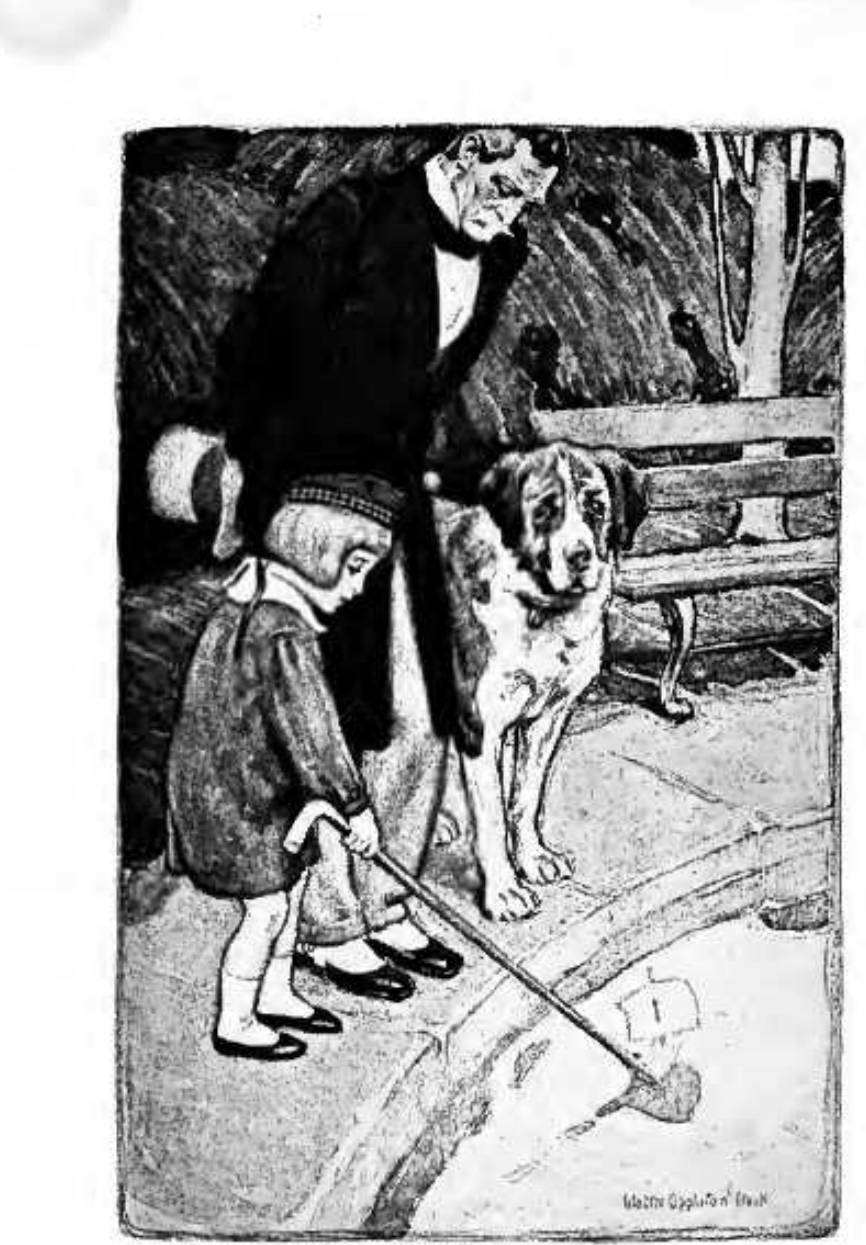
From a drawing by Walter Appleton Clove THE STICK BOAT ON THE ROUND FOND