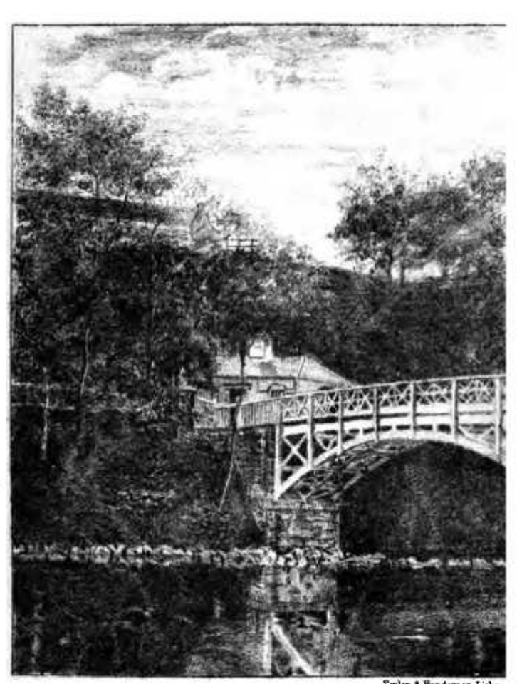
GRANDHOLM BRIDGE, OVER THE DON