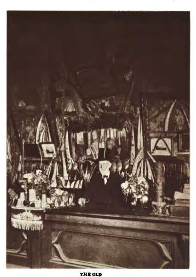
COBWEB PALACE AT MEIGGS'S WHARP