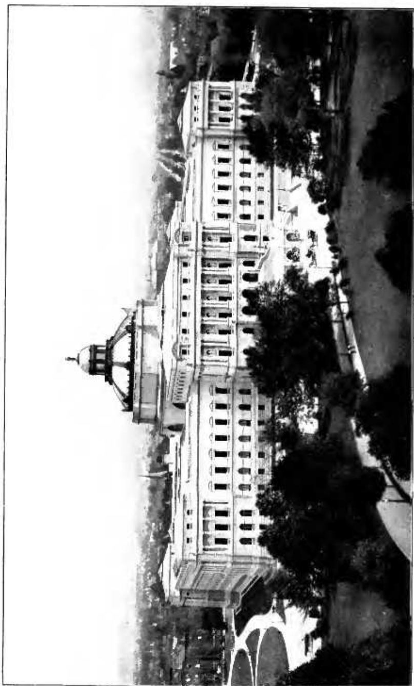
THE LIBRARY OF CONGRESS.