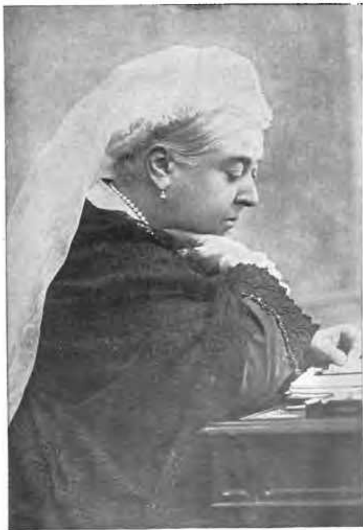
HER MAJESTY, QUEEN VICTORIA.