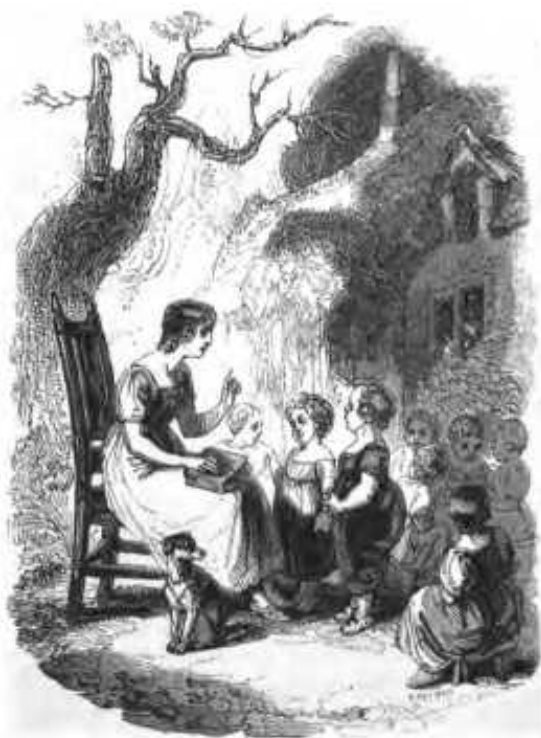
HER ANXIETY FOR THE CHILDREN ROUND HER GAVE RISE TO HER SUNDAY SCHOOL. PAGE 70.