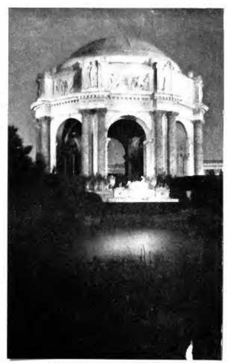
THE ROTUNDA OF THE PALACE OF FINE ARTS A VIEW BY NIGHT