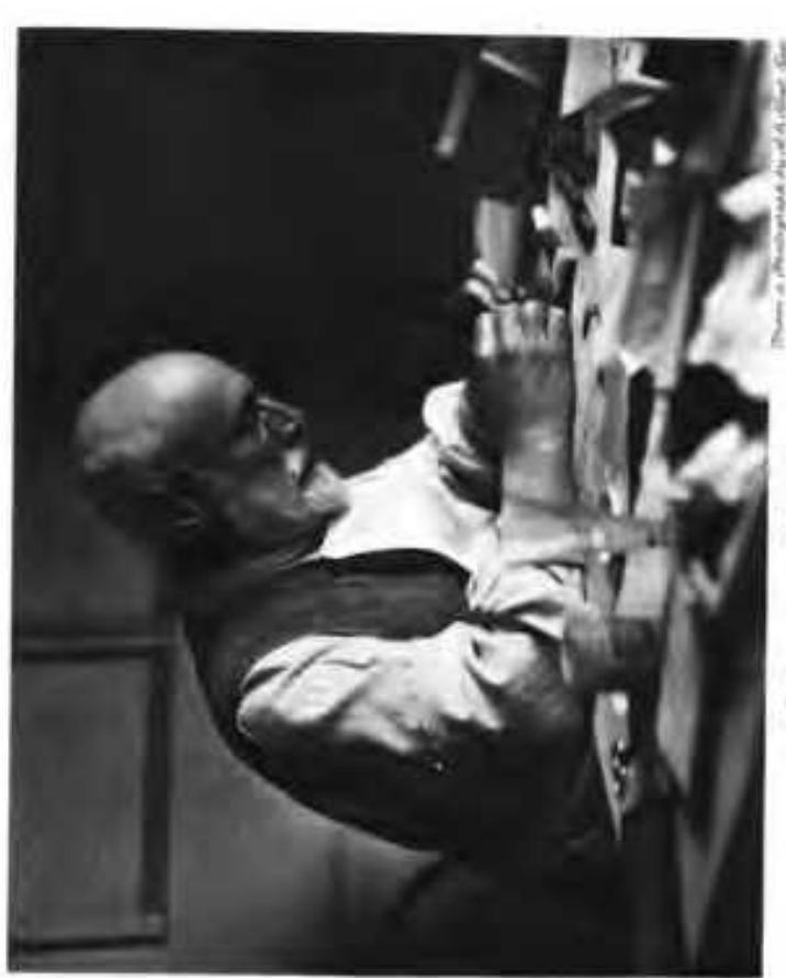
Detached Radger at Mert.