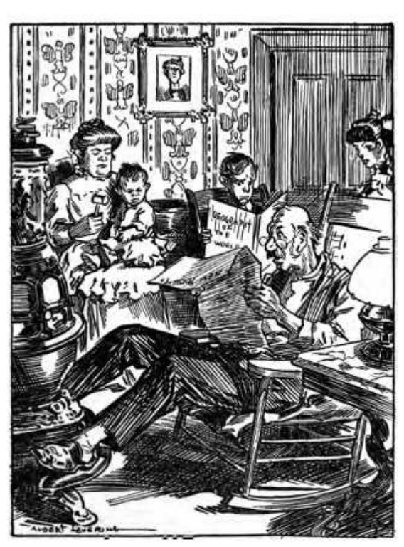
"While thus crisping himself be loved to read News Notes from Gotham"