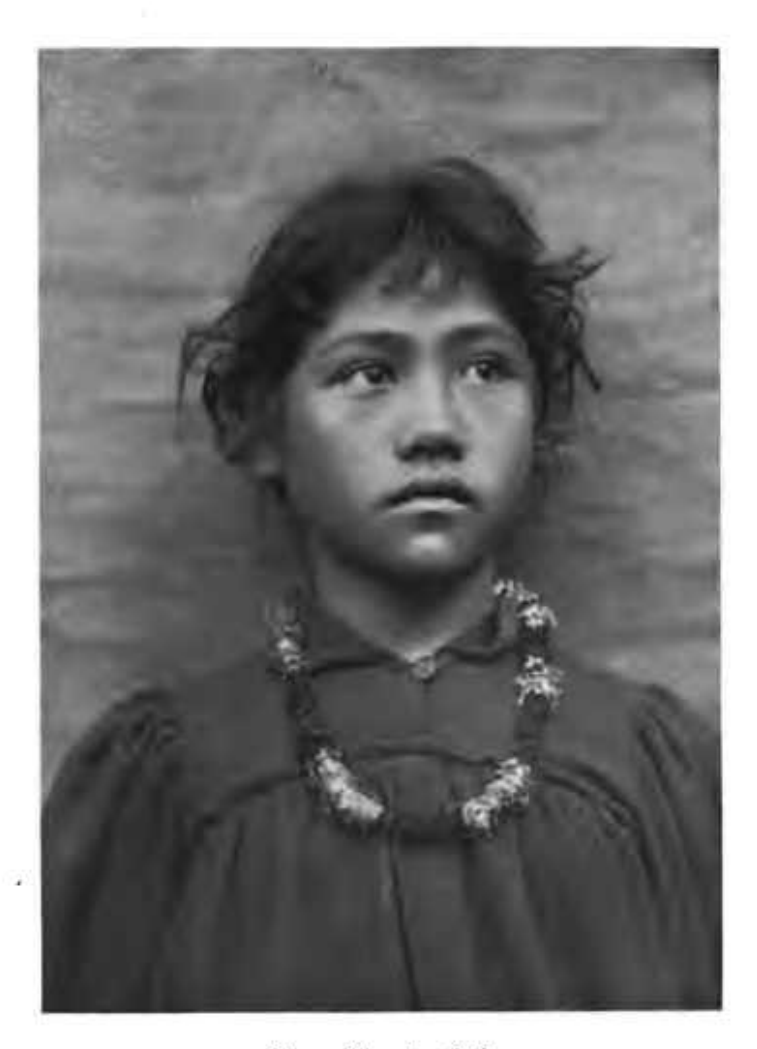
Young Hawaiian Girl.