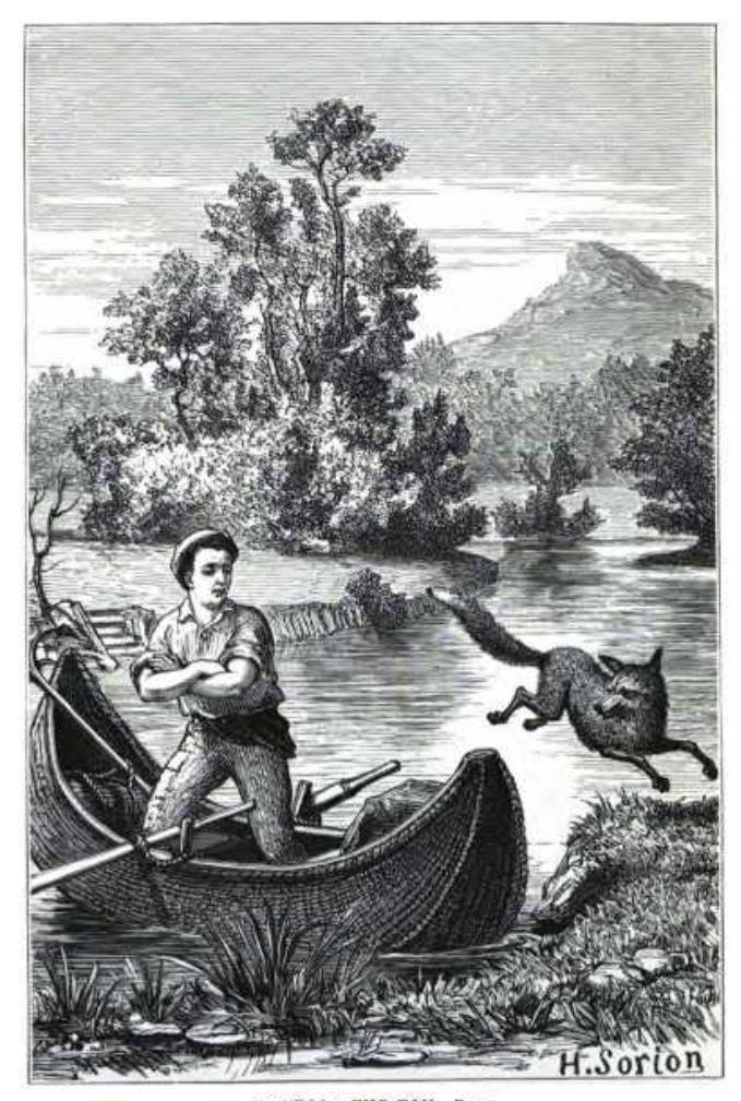
ACHERIA, THE FOX.-P. 43-