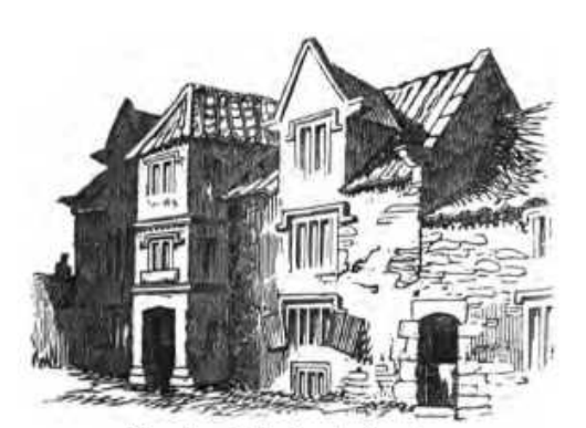
Manor-house, Byker, Serenteenth century.