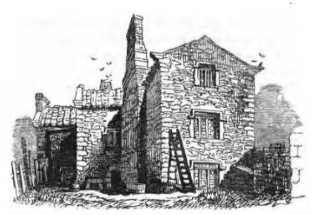
Manor-house, Byker-West end.