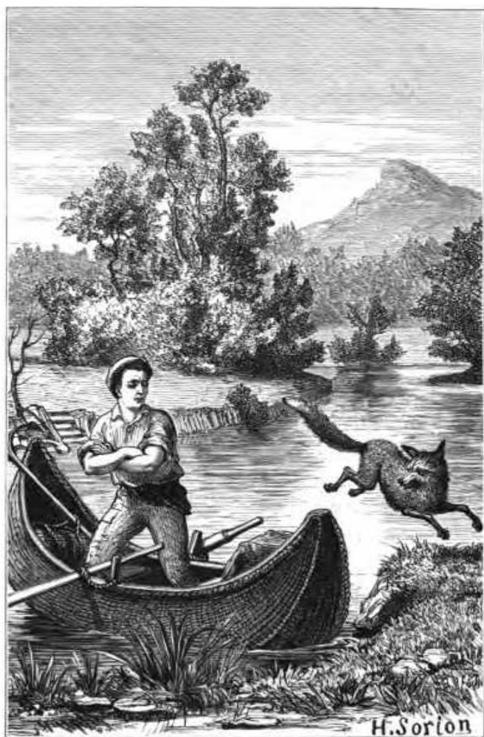
ACHERIA, THE FOX.—P. 43.