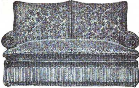
(NEW PILLOW STYLE.)