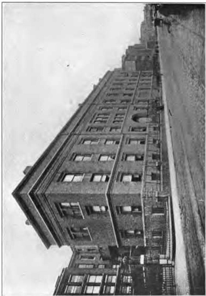
COLLEGE OF PHYSICIANS AND SURGEONS, FIFTY-NINTH STREET.