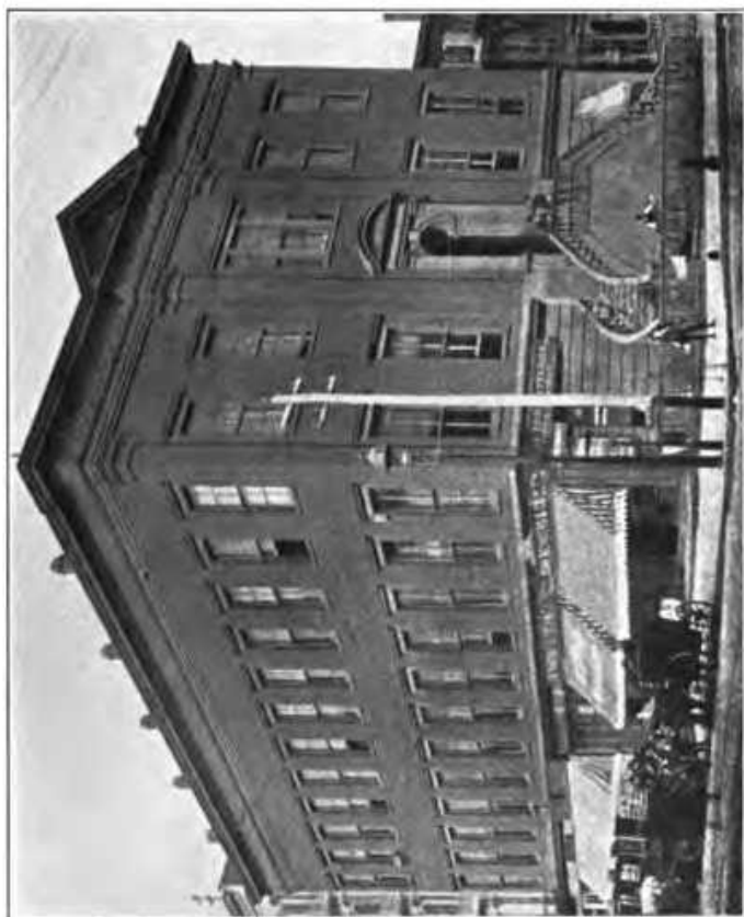
FORMER COLLEGE OF PHYSICIANS AND SURGEONS, FOURTH AVENUE AND TWENTY-THIRD STREET.