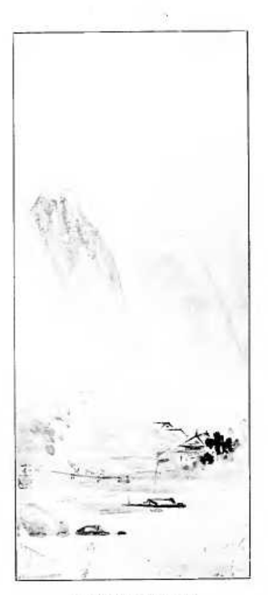
A RAINY LANDSCAPE From a Kakemono by SANSETSU (Evitin Alexant)