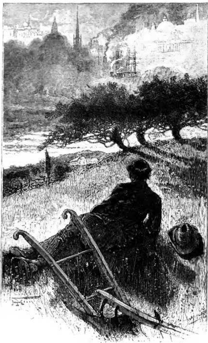
"THESE ARE THE SPIRES THAT WERE GLEAMING."