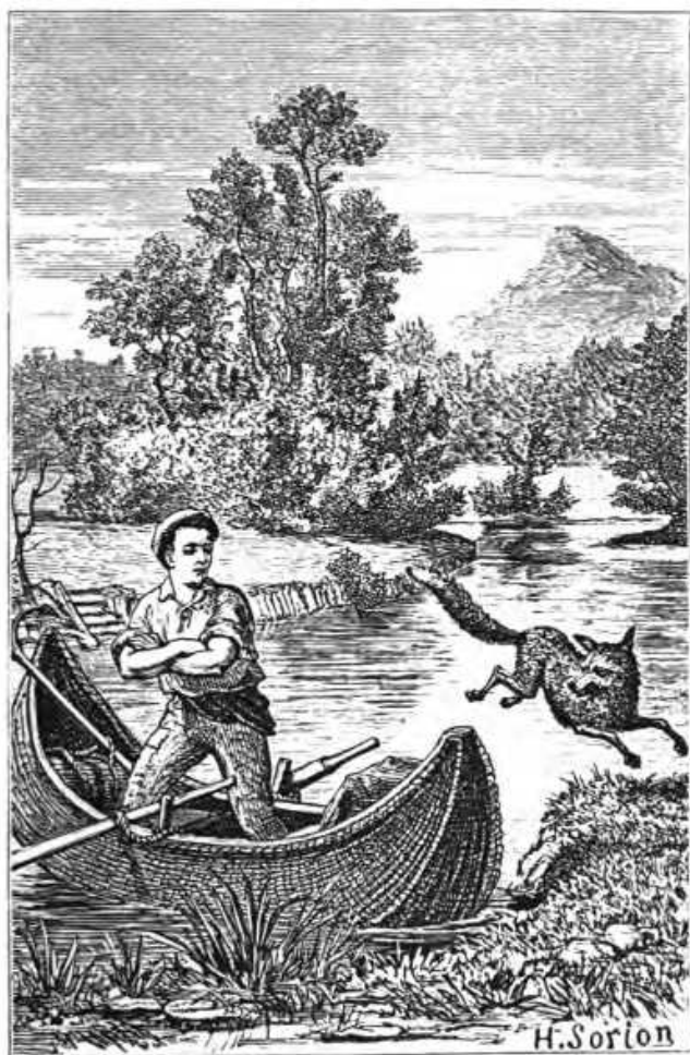
ACHERIA, THE FOX.—P. 43.