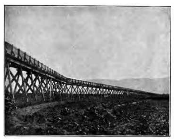
IRRIGATION FLUME, FORT ROMIE.