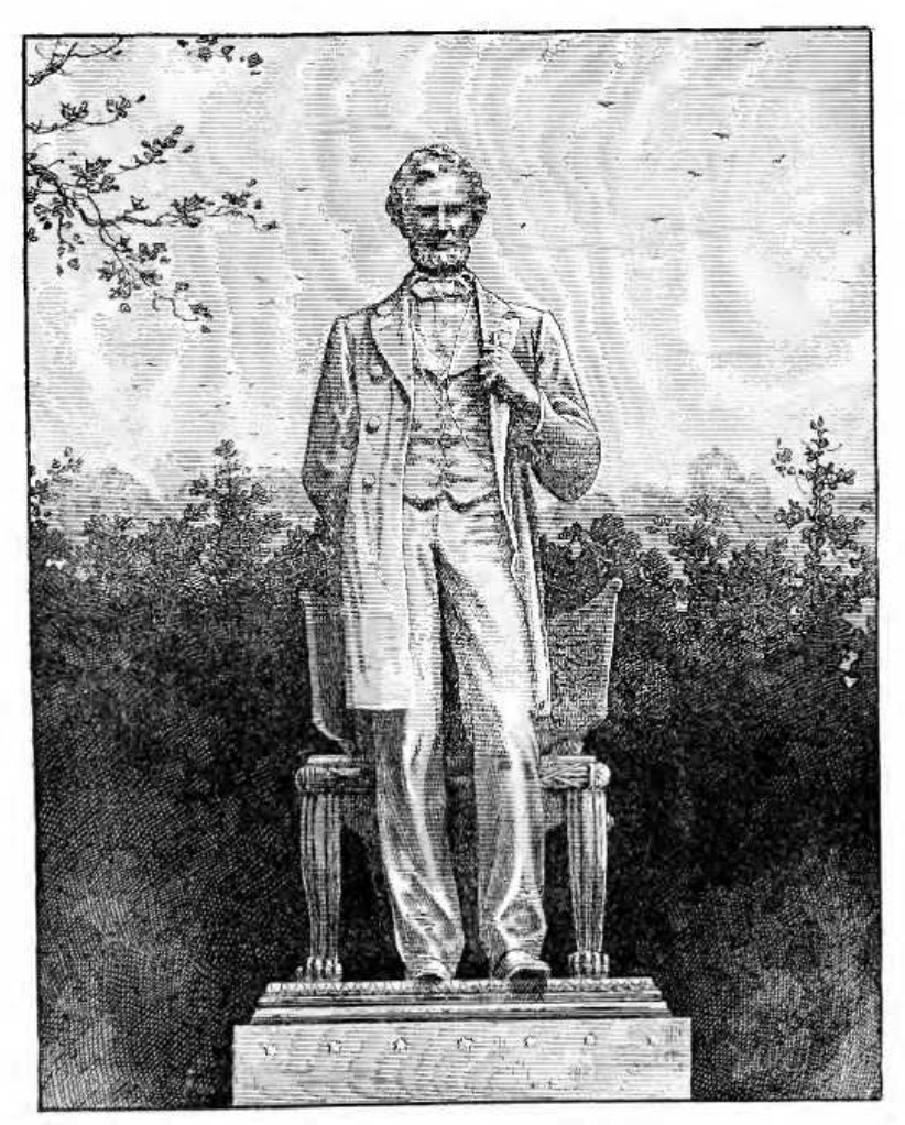
STAT-UE OF LIN-COLN, IN LIN-COLN PARK, CHIC-A-GO.