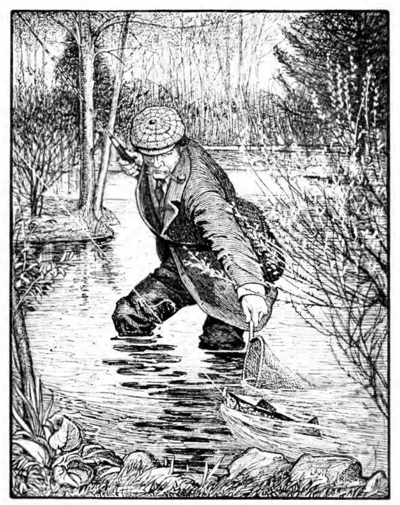
When the pussy-willows bloom